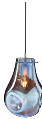
soap pendant large blue / stainless steel 430 EUR