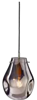
soap pendant small silver / stainless steel 380 EUR