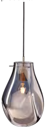
soap pendant large silver / stainless steel 430 EUR