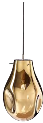
soap pendant large gold / stainless steel 430 EUR