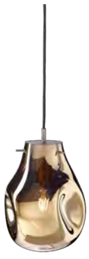
soap pendant small gold / stainless steel 380 EUR